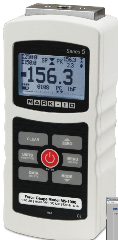
MESUR™ Lite data acquisition software is included with the gauges