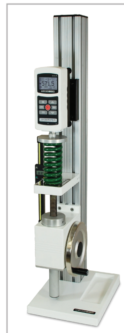
Shown with a TSF test stand in a spring testing application

The gauges' averaging mode addresses the need to record the average force over time, useful in applications such as peel testing, while external trigger mode makes switch activation testing simple and accurate. An ergonomic, reversible aluminum design allows for hand held use or test stand mounting for more sophisticated testing requirements. The force gauges are directly compatible with high capacity Mark-10 test stands, grips, and software.