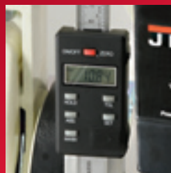
Digital Read Out