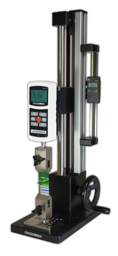
The ES30 is shown in a typical compression testing application, with Series 5 digital force gauge, digital travel display, and attachments