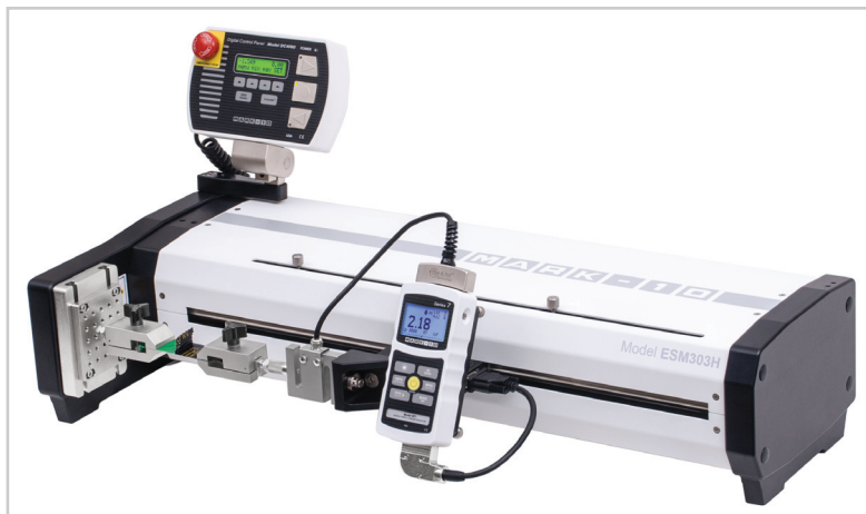
ESM303H is shown above configured for a peel test, with a Model M7i indicator, Series R01 load cell, and G1008 film and paper grips.

The ESM303H is a highly configurable horizontal force tester for tension and compression measurement applications up to 300 lbF [1.5 kN], with a rugged design suitable for laboratory and production environments. Sample setup and fine positioning are a breeze with available FollowMe™ force-based positioning - using your hand as your guide, push and pull on the force gauge or load cell to move the crosshead at a variable rate of speed.