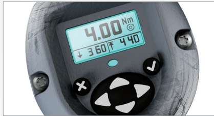
Multiple torque configurations and strategies