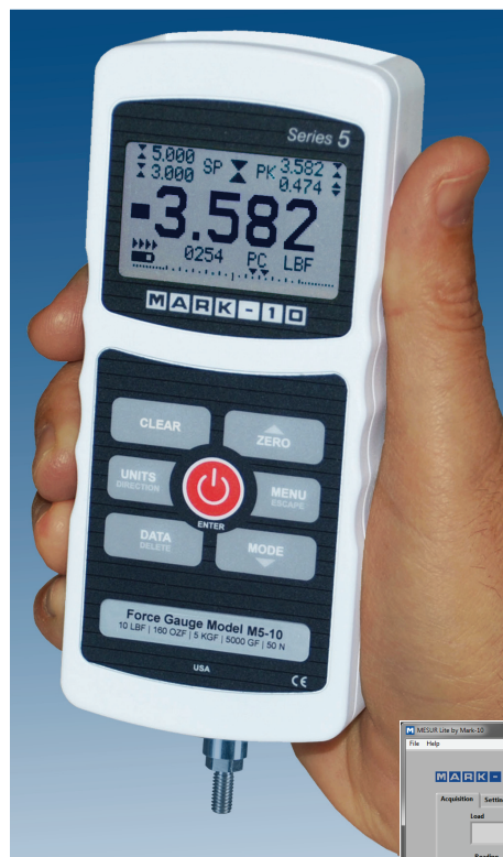
MESUR™ Lite data acquisition software is included with Series 5 gauges