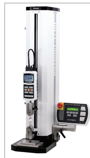
Shown with an ESM303 test stand and G1061 wedge grips

Series 5 gauges include MESUR™ Lite data acquisition software. MESUR™ Lite tabulates continuous or single point data from Series 5 gauges. Data saved in the gauge's memory can also be downloaded in bulk. One-click export to Excel easily allows for further data manipulation.