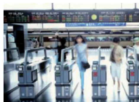
Access control and Ticketing