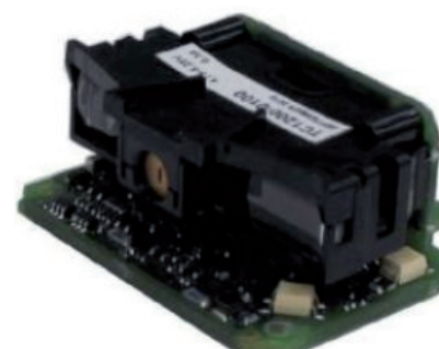
TC1200 SCAN ENGINE MODEL