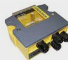
CBX100LT Connection Box