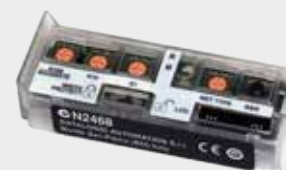
BM100 Backup Module