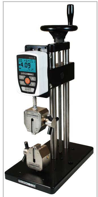
Shown with an ES20 test stand and G1061 wedge grips

The gauges include MESUR Lite data acquisition software. MESUR Lite tabulates continuous or single point data. One-click export to Excel allows for further data manipulation.